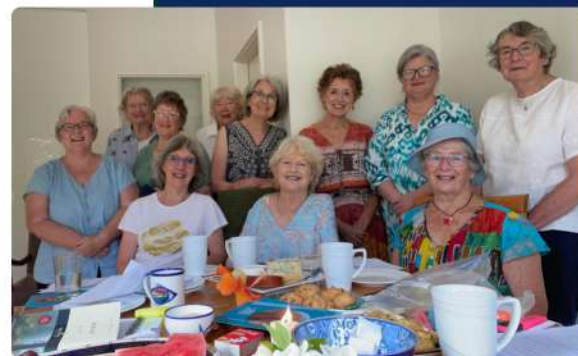
The Caritas women's Study Group in action!

As I struggled through the complexity of economic theory and practice in this book, I have found overwhelmingly a deep statement of moral philosophy. The Good Society demands that collective government provide checks and balances. The Road to Freedom means the economy is for all, leading to freedom from want and fear, freedom to flourish and freedom to live to one's potential. It is a vision for change in our troubled world.