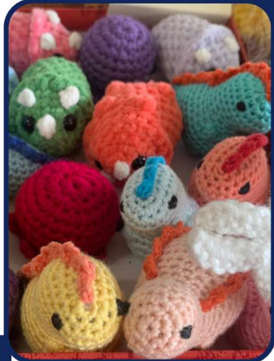
A selection of adorable Crochet Creatures from Coatesville's fete!