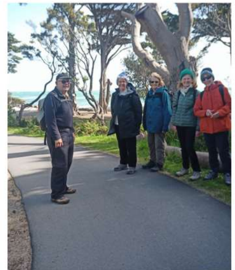
Striking a pose on a stop to admire the beautiful Peninsula scenery.

Saturday commenced with another great breakfast feast thanks to the Mt Martha Uniting Church, along with some inspiring presentations from local environment action group BERG (Balcombe Estuary Rehabilitation Group) and a member of Mornington Peninsula Koala Tree Planting. The passionate presentations were the ideal segue as our walkers headed to the Mount Martha Briars property, where many participated