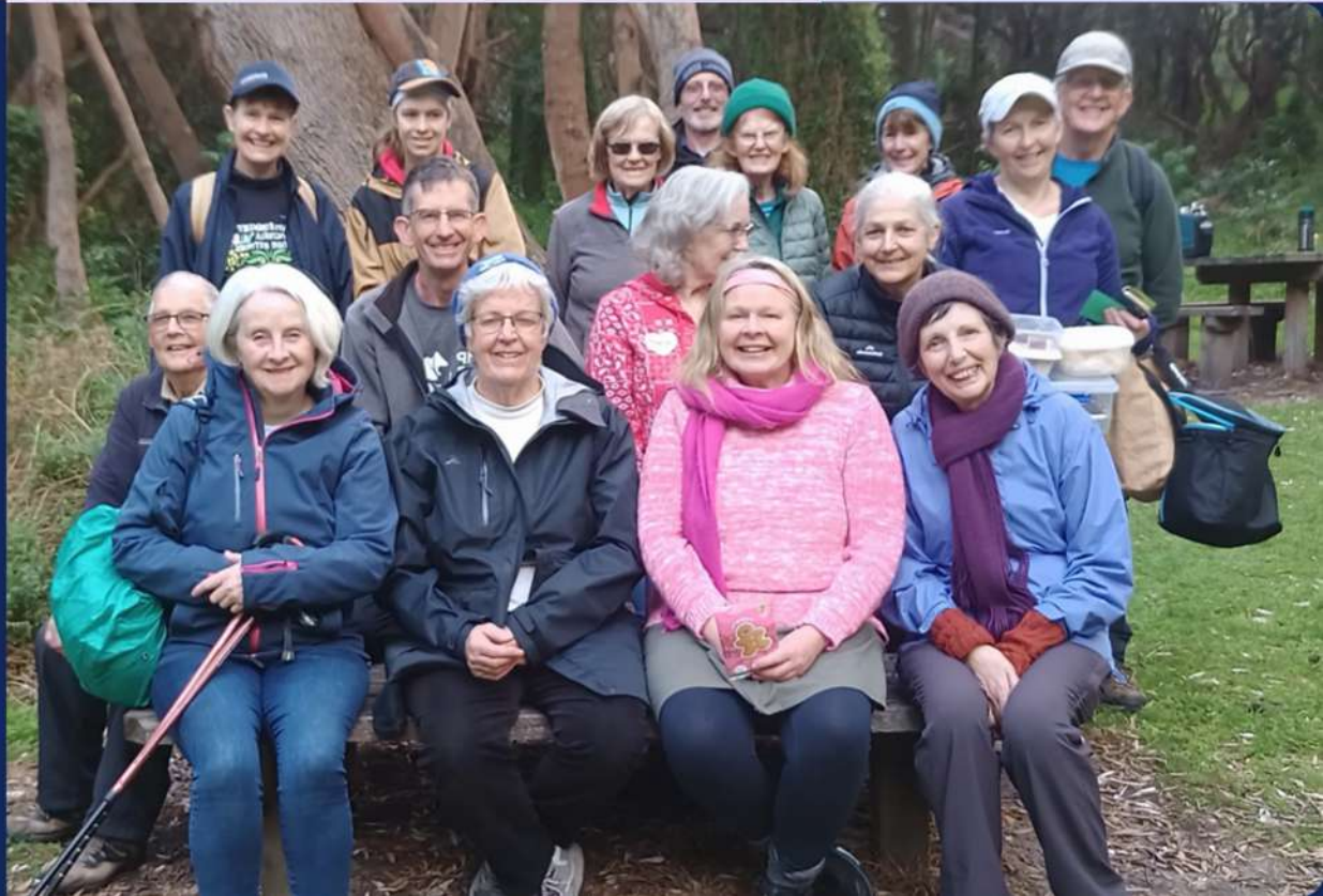
Sitting down for a hard-earned rest and a giggle

It was incredible to take a final look back at the our hard work, planting 800 Koala-friendly trees!