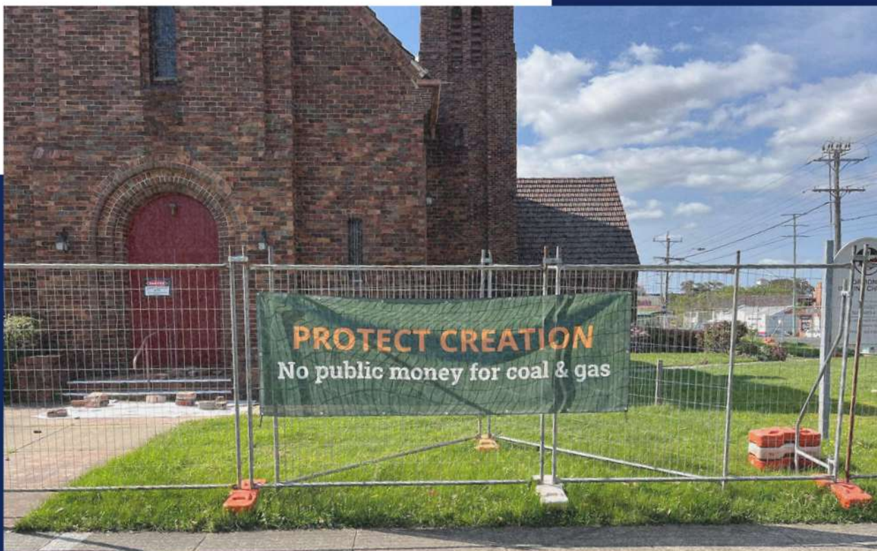
Banners by the Australian Religious Response to Climate Change, displayed at Ormond Uniting Church as it undergoes renovations.

“The glaring truth of Climate Change is that ALL people and nations must act now!”