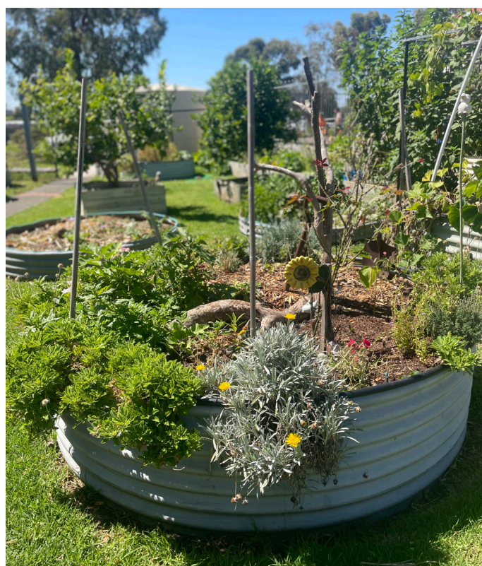
Hampton Park UC Community Garden