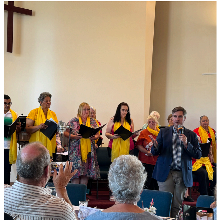
Congregation Choir singing songs