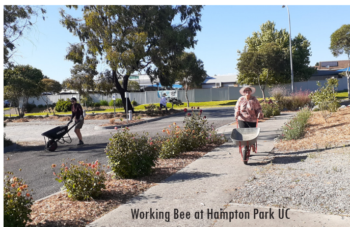
Working Bee at Hampton Park UC