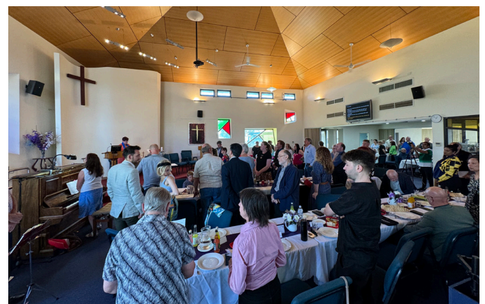
Hampton Park Congregation sharing in a meal