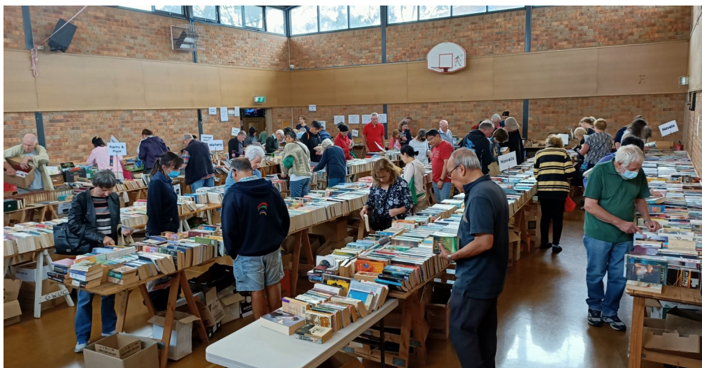
Local community members picking up a bargain.

Church Council, Secretary Glen Waverley UC