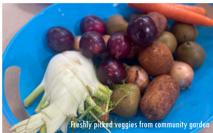
Freshly picked veggies from community garden