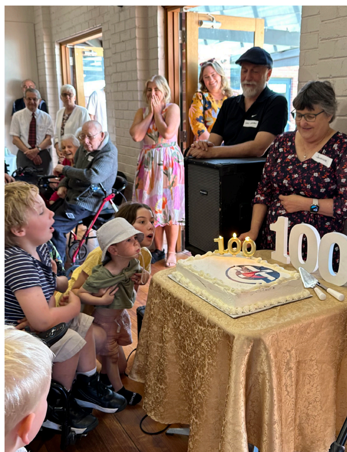
St David's Parkdale congregation celebrating 100 years.

St David's Parkdale Uniting Church began life as Parkdale Methodist Church on November 4, 1923, initially meeting in a hall on a neighbouring corner block. The existing church was completed in 1926 and has undergone a number of modifications since.