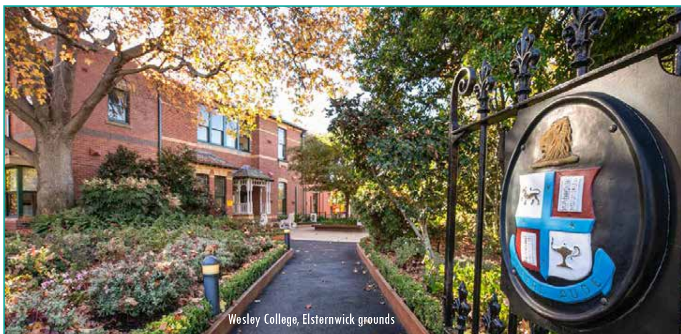
Wesley College, Elsternwick grounds

In this ministry I am invited into caring relationships with staff and students, invited to ask uncomfortable questions of meaning and purpose, to weep with, laugh with and somehow be a place of calm in the frantic speed of school life.