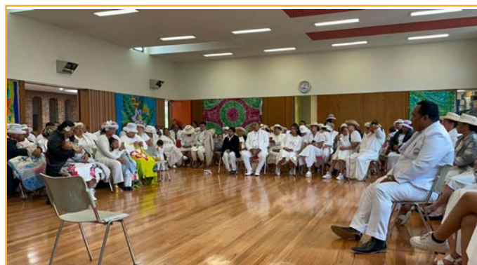
Members of Cook Islands congregations across Melbourne joined together for an Easter service.

This event will be a cultural extravaganza with many churches participating. It will be a very busy time for our Cook Islands congregations across.