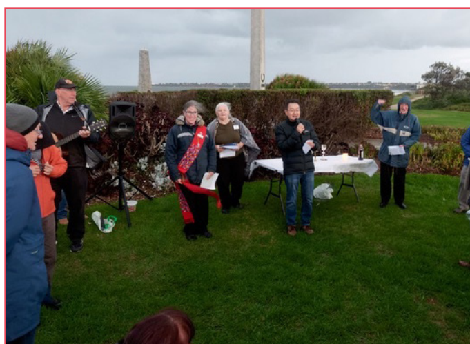
Members at Parkdale Beach, on a windy wet morning. Celebrating the return.