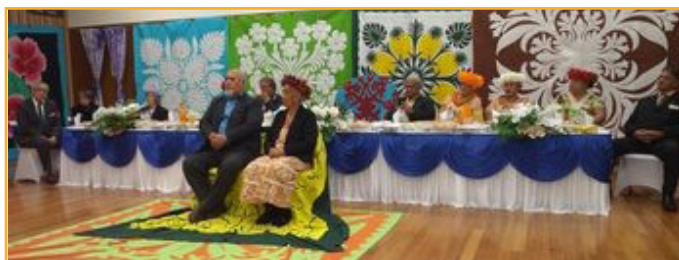
Queen and Papa Soatini are welcomed to Clayton, showing the tivaevae around the walls.