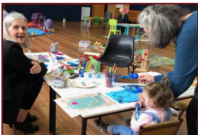
St Leonard's Playgroup