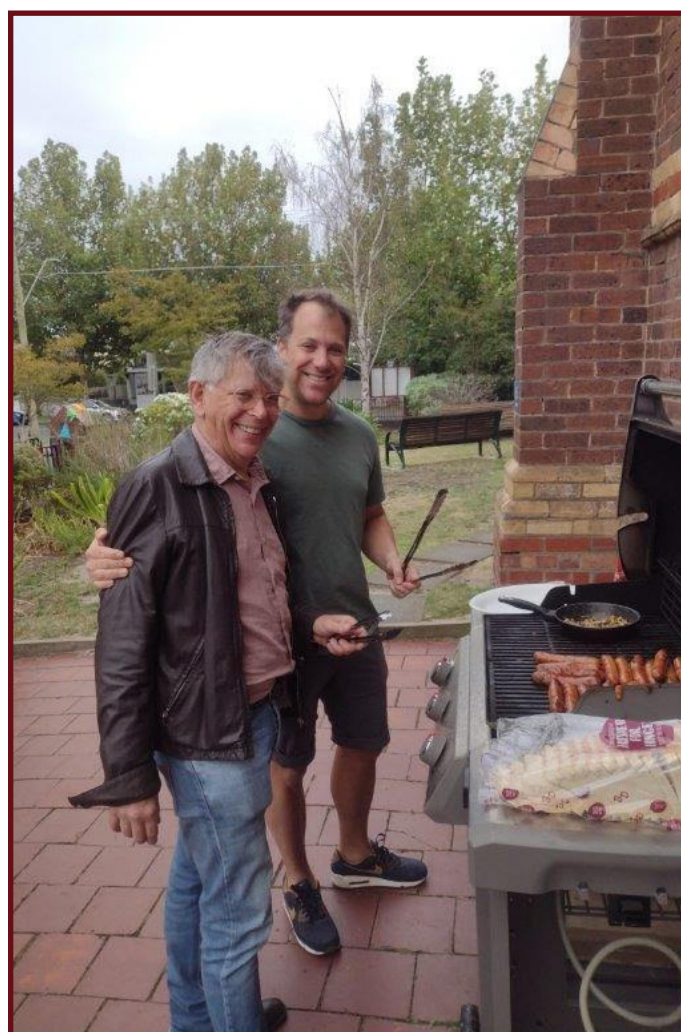
Partnering up with our friends from Arrow Health who provided the sausages on Neighbour Day.