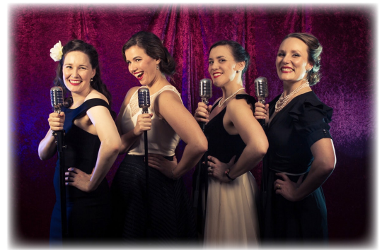
Life is a cabaret, old chum

Gallery & Manse Gallery Cafe Open 10am - 3pm, Monday to Friday General Enquiries: Tel 0404 078 105 or 9829 0340