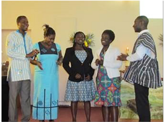
MONASH Uniting Church members from Ghana led the singing during worship on Sunday. The previous week, six new members were received, from Ghana, Burma, Malaysia Indonesia and Australia.