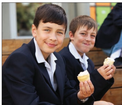
as she shares her joy and pride at Cornish' special day. Below: cupcake heaven.

THERE was a moment when Cornish College faced the desperate prospect of closing its doors for the last time.