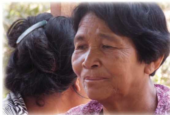
Sharing lunch near Siem Reap, Cambodia