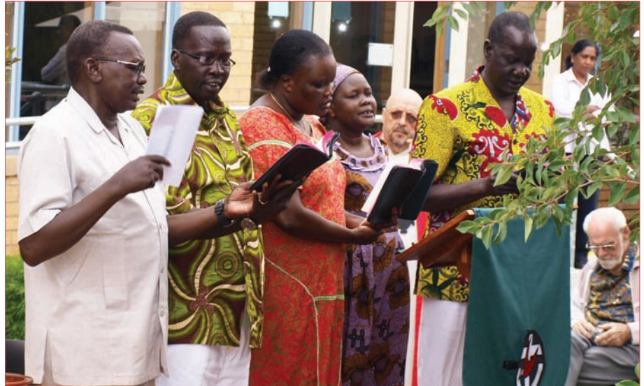
Above: South Sudanese members at Springvale UC delight the crowds with their stirring singing

"This has been a remarkable example of co-operation between the Church and the Springvale Community. The shed is attracting grants from individuals and community groups and as the use of the shed programme progresses we will be looking for funding for future programmes to extend the mission of Wominjika Place," concludes John.