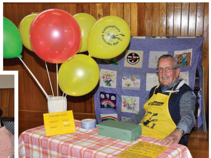
Flipping pancakes and taking donations were just some of the roles adopted by St Martin's UC folk.