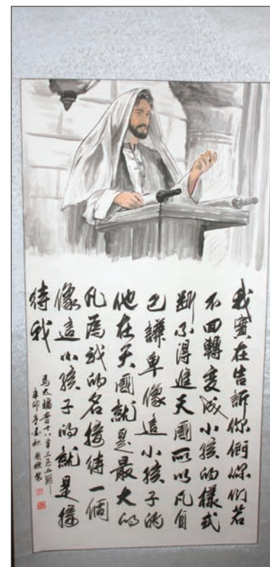
Above: two of the sacred scrolls from China that will be exhibited throughout May at the exhibition, see below.