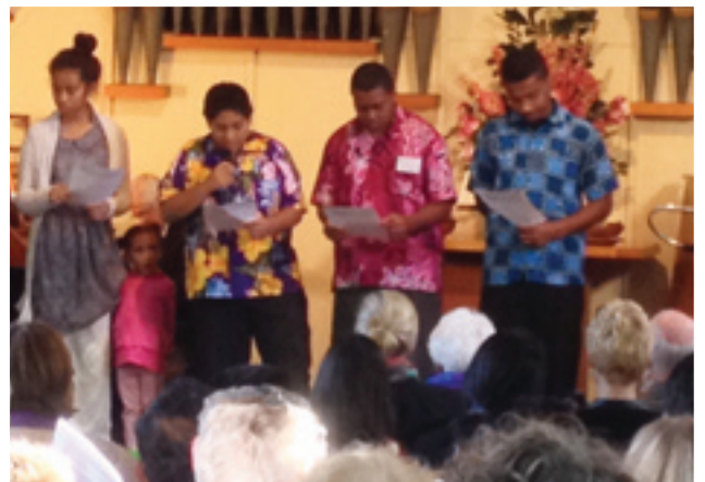
ABOVE and left: members of the youth groups join the fray and the choir sings out for the assembled guests.