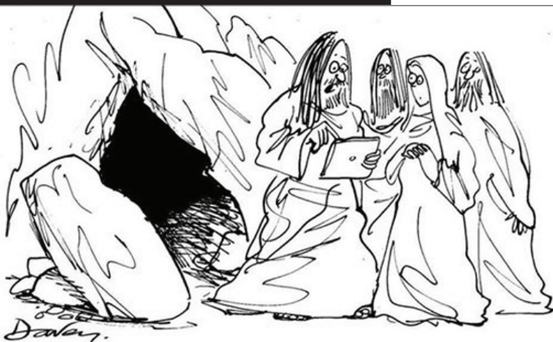
"He's not in there! Oh, wait - he's changed his status to 'risen' "