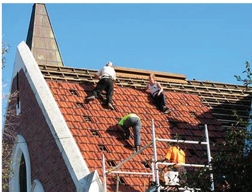
Nothing but blue skies.... work get's under way to replace the roof at Hampton UC after a huge fundraising effort