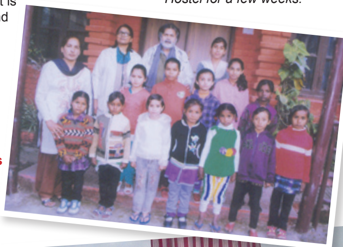
Left: this photo was sent in November 2012, when only 13 girls were in the Hostel...