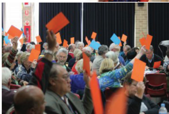
Top: group gathering. While some of the many PPE reps at Synod are pictured above and below