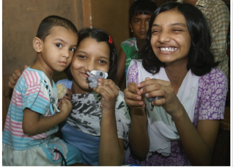
Students at Nav Nirman School for Children of Sex Workers, Delhi, India.