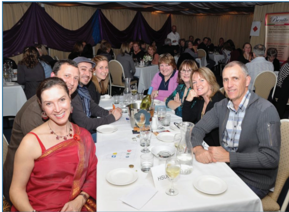
Pictured above and right in the function room (donated by Benito's Restaurant, Mt Eliza) are two of the trivia groups from HSUC