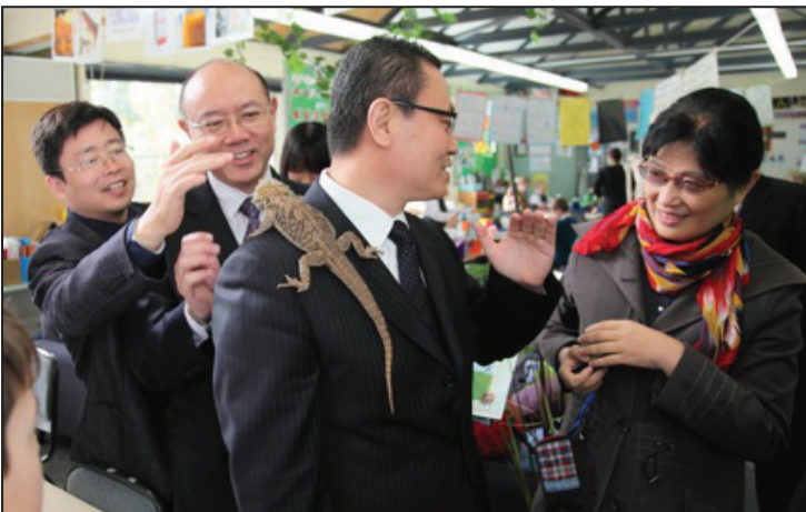
Above: Guest star...China Christian Council delegates show their fascination with Cornish College's frill-neck lizard